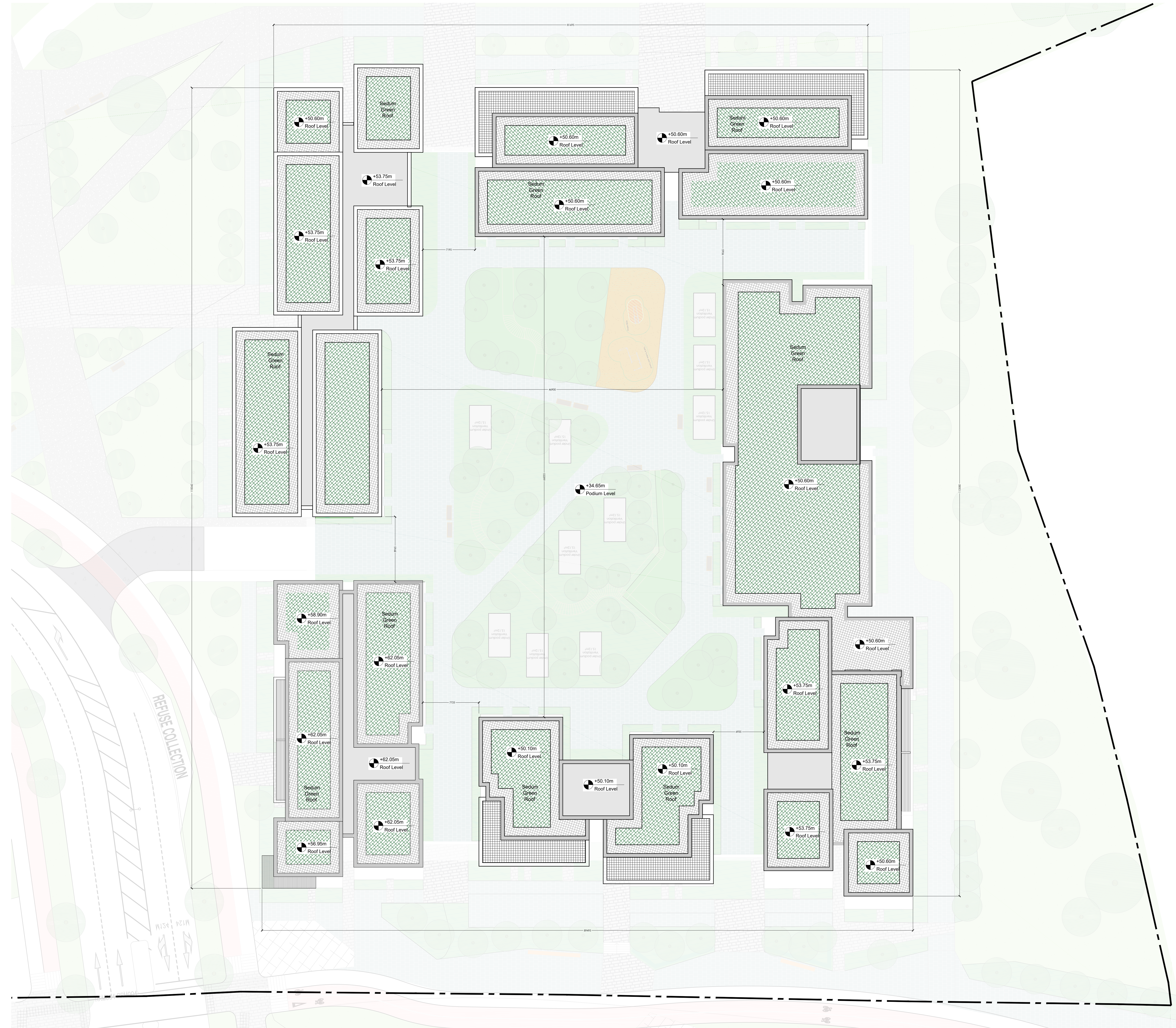
Roof Plan - Block 1 Scale 1:200 @A0

Note: Refer to Unit Type Drawings for further details on Unit Type Layouts and Areas.